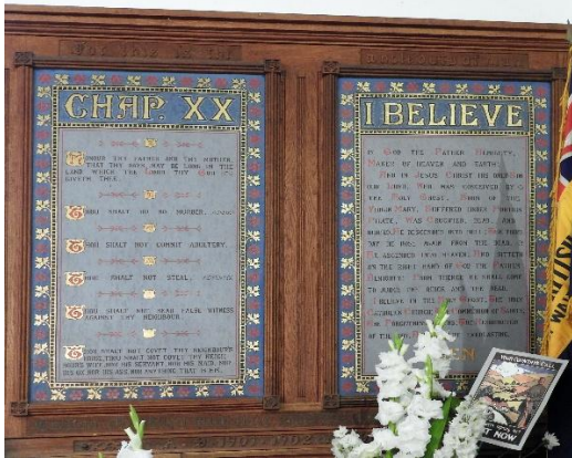
St Michael the Archangel, Woodham Walter

I believe in God the Father Almighty, Maker of heaven and earth. And in Jesus Christ, His only Son, our Lord; Who was conceived by the Holy Spirit; Born of the Virgin Mary; Suffered under Pontius Pilate; Was crucified, dead and buried; He descended into Hell; The third day He rose again from the dead; He ascended into heaven;.